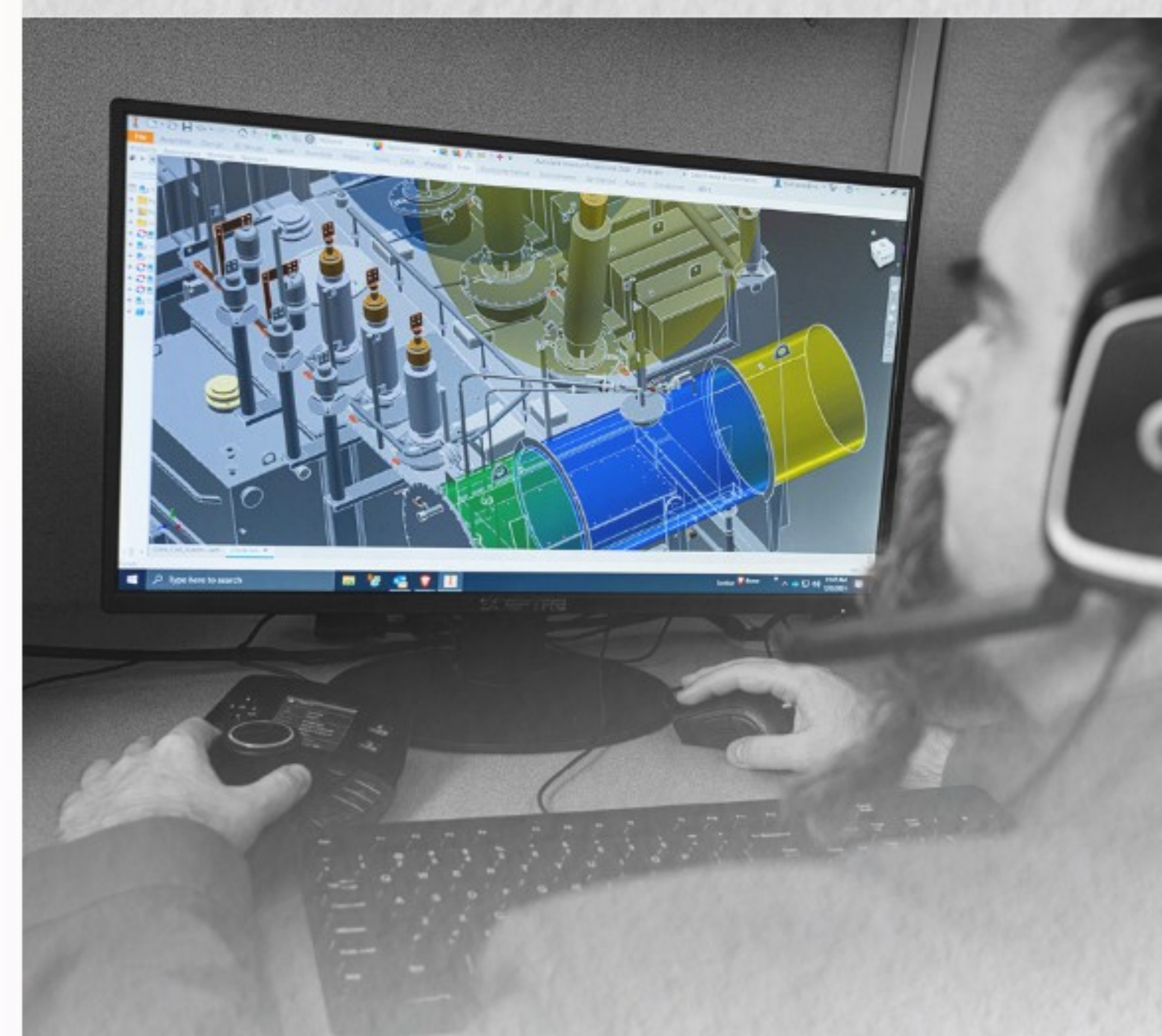
Our expert engineers design every transformer with a 60-year lifespan for maximum reliability and uptime.

Learn more about Virginia Transformer and how we can help power your next project by visiting www.vatransformer.com .